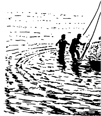
Remains of ancient

JN. 2:13-2:22, 3:22, 4:1-42, 5:1-18, 7:1-10, 10:40, 11:1-44, 54