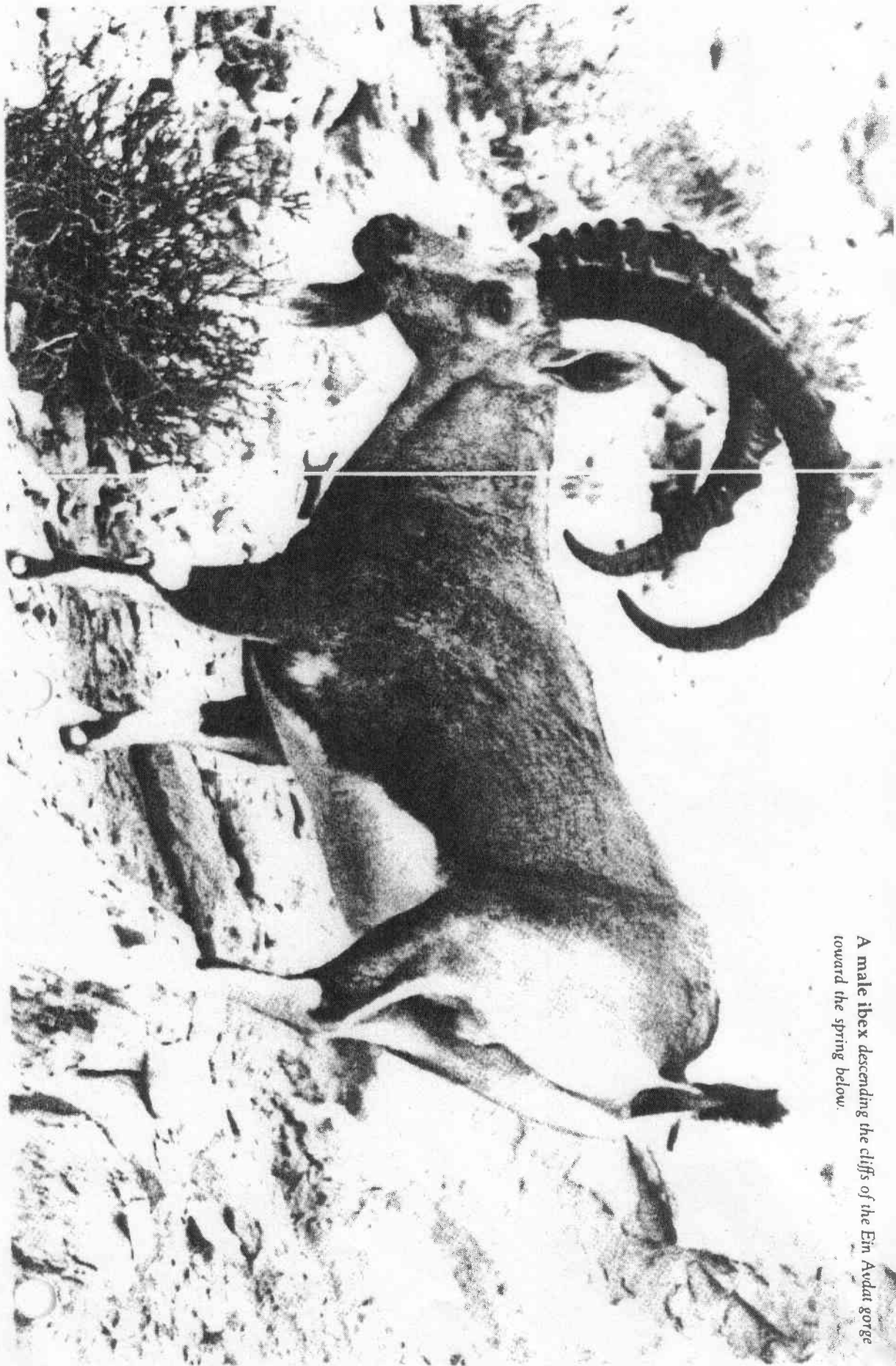
A male ibex descending the cliffs of the Ein Avdat gorge toward the spring below.